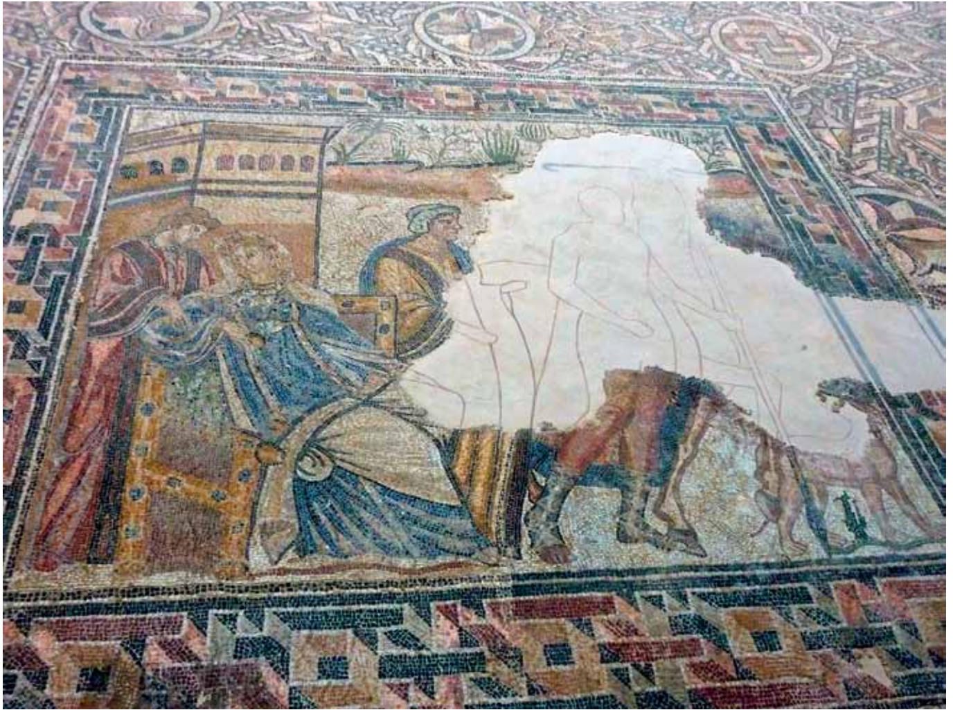
Figure 8 Arellano. Parting of Adonis. In situ.

expression of sadness and despondency. The midwife combs her hair with a part in the middle. The hair falls down on both sides of her face. She has a double necklace around her neck, and wears a tunic and a blue-greenish cloak. A white veil covers the head and falls over her shoulders and back and over her knee.