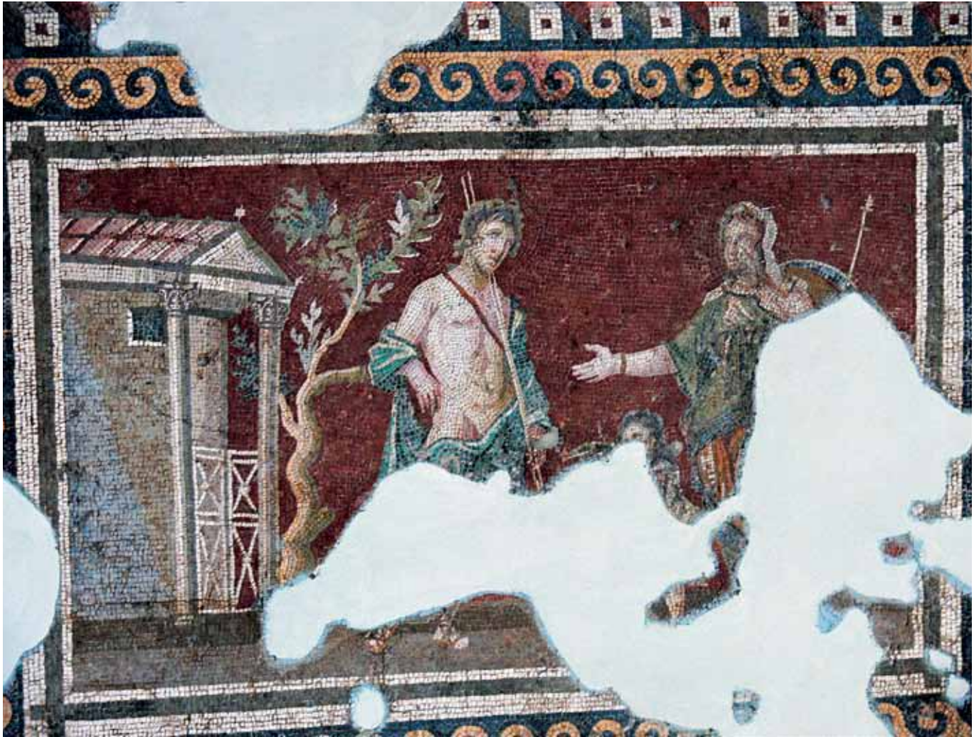
Figure 6 Antioch. House of the Red Pavement. Aphrodite and Adonis. Antioch Museum.

of the amphitheatre. Only Adonis seems to follow a traditional iconography. Adonis stabs a hefty wild boar with the spear. A dog is beside him. The scene is located in the countryside (Levi 1974: 338 fig. 136; Dunbabin 1999: 181 fig. 194; Cimok 2000: 252-253).