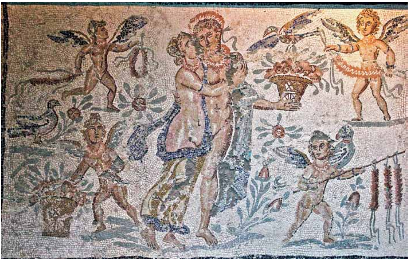
Figure 7 Lixus. Aphrodite and Adonis. Erotes. Tétouan Museum.

It must be highlighted that the two big myths of wild boar hunting, that of Aphrodite and Adonis and that of Meleager and Atalanta, had no acceptance in