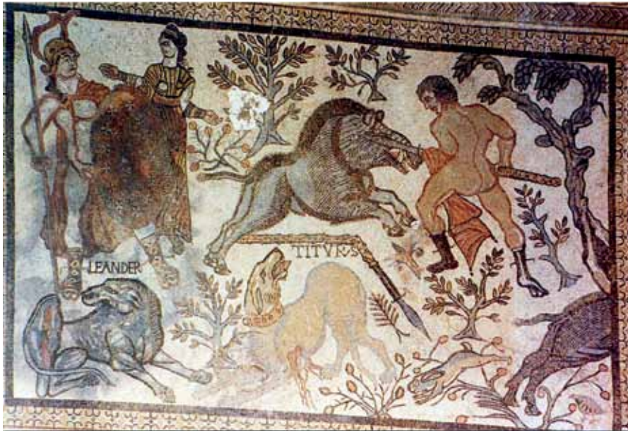
Figure 10 Carranque. Adonis spearing a wild boar. In situ.