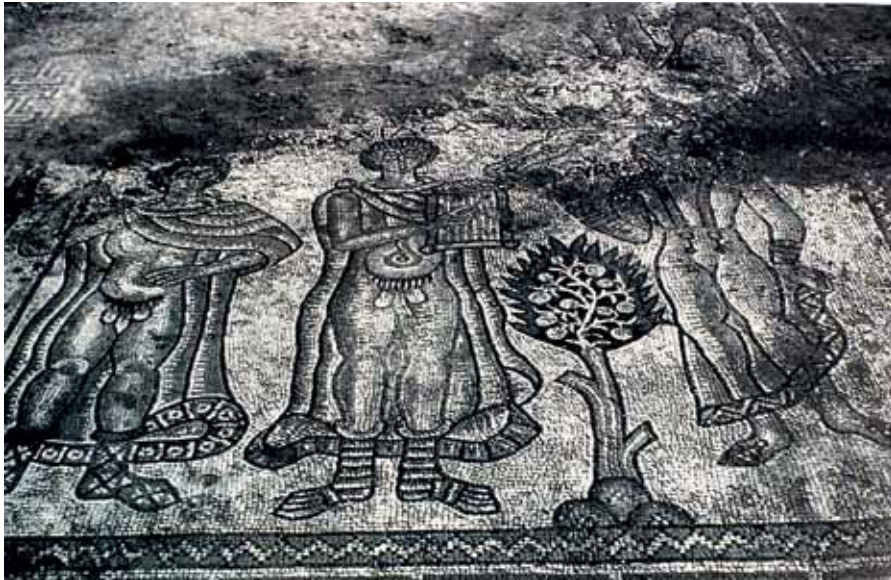
Figure 3 Madaba. Achilles, Patroclus, Hube. Madaba Museum.