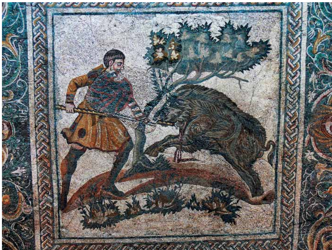
Figure 11 El Hinojal. Adonis spearing a wild boar. Museo Nacional de Arte Romano, Mérida.

1978: 52 fig. 12, Table 95-96; Blázquez 2008: 28 fig. 22; Blázquez – Cabrero 2012: 51-52 fig. 8). The mosaic is subdivided in three parts. Only the central part of it is interesting for this paper. It is decorated with the hunt of a wild boar by a hunter who resists the charge of the beast standing firmly with a spear. The mosaic was thoroughly restored in some of its parts during Antiquity. The hunter dresses like men of that time. The inscription of the already mentioned mosaic from Antioch with the bust of Megalopsychia has a similar subject. It indicates that the hunter is Adonis. The fight takes place in a field, as shown by the brushes in broad daylight, because the shadows of the hunter and the wild boar project themselves on the ground.