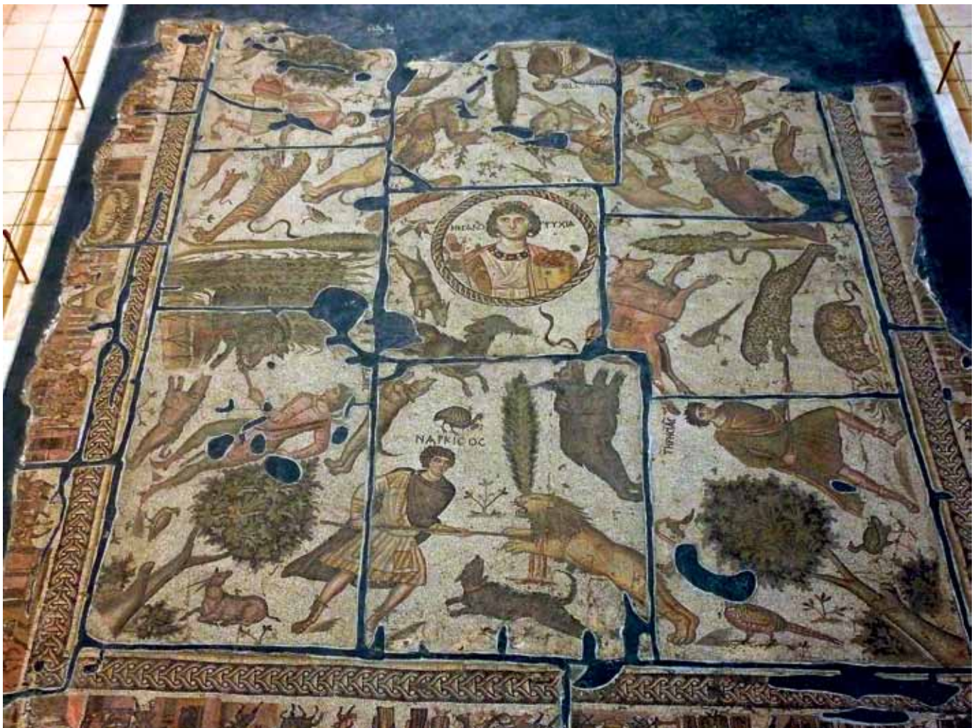
Figure 5 Antioch. Yakto complex. Megalopsychia. Adonis spearing a wild boar. Antioch Museum.

In the mosaic of the Yakto complex, Megalopsychia (Fig. 5), given that name because of the bust at the centre of the composition surrounded by scenes of hunting that probably dates from 450-469 A.D, we find Adonis, Meleager and some others. They wear costumes of the time and clearly represent venatores