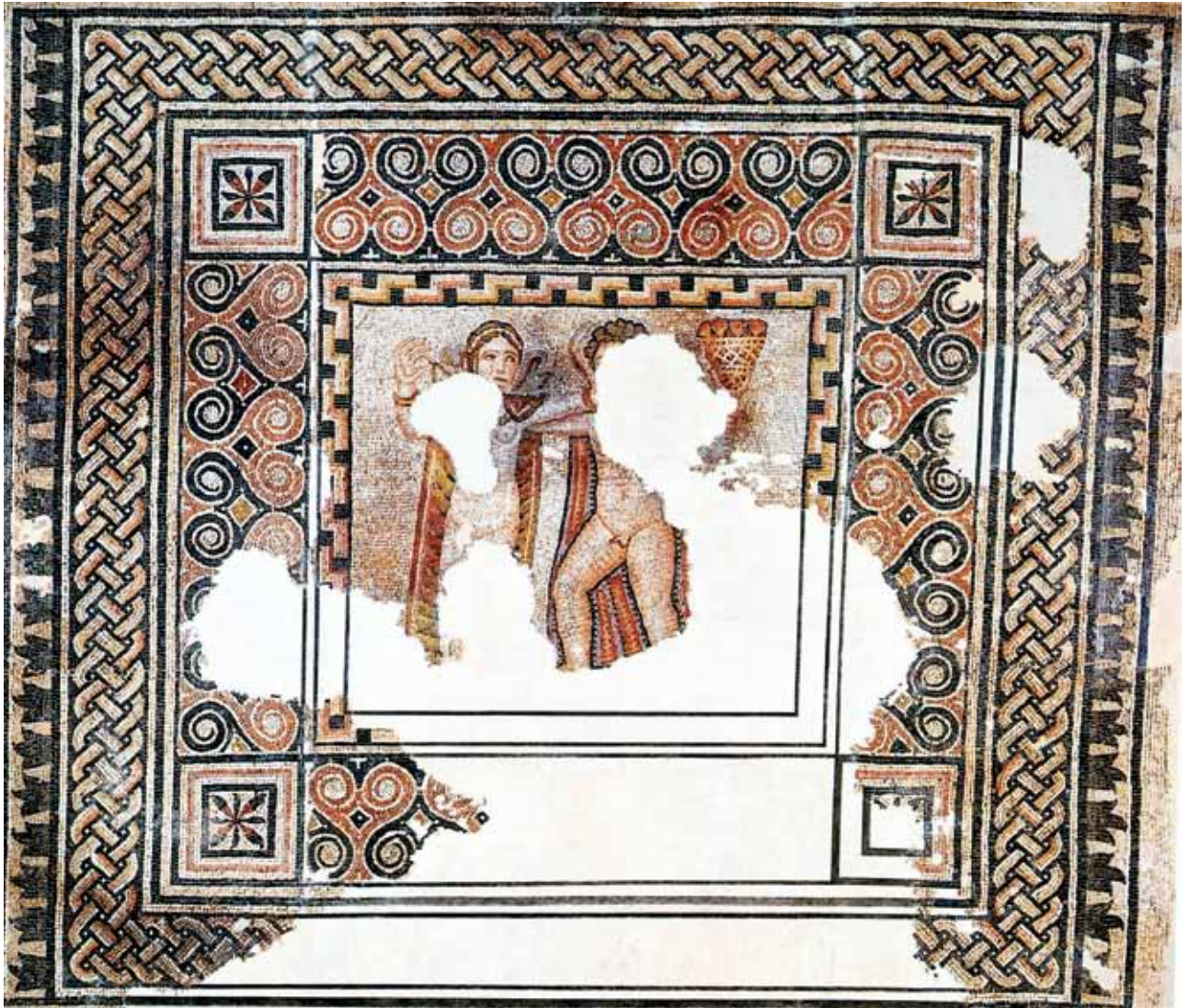
Figure 13 Fraga. Aphrodite and Adonis. Museo de Huesca.