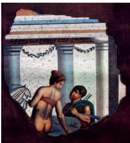
Figure 9 Tarragona. Aphrodite and Adonis. According to A. Balil.

A second farewell of Aphrodite and Adonis (Fig. 9) is only known in picture. It was found in 1802 in the so called quarry of the port of Tarragona. The farewell takes place in front a double portico of Corinthian columns decorated with garlands. A naked Aphrodite stands backwards in front of a throne and wears a brassiere. On her side, Adonis wears a cloak and looks absorbed to her loved one. He carries two spears leaning them against his shoulder (San Nicolás 1994: 400 fig. 3; Blázquez 2013: 88).