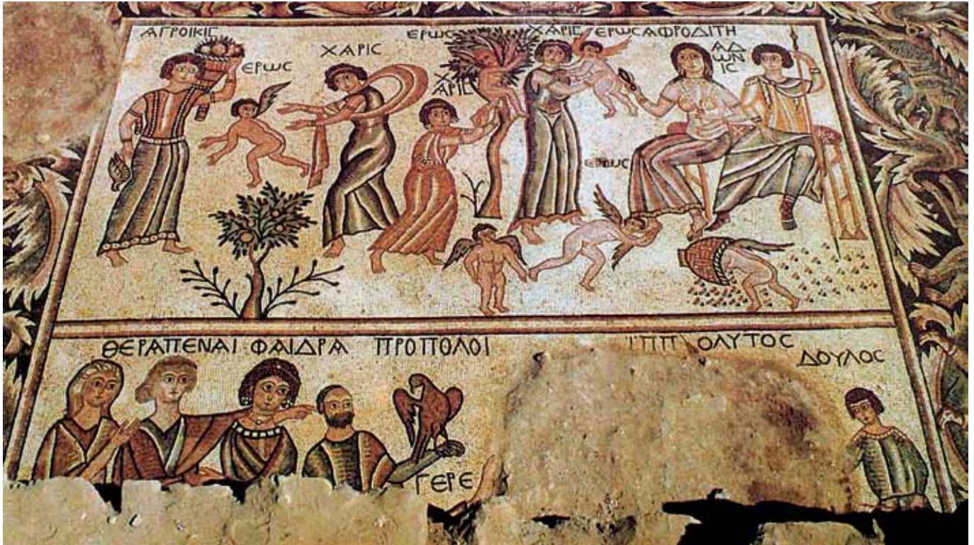
Figure 1 Madaba. Aphrodite, Adonis. The Charites. Erotes. Peasant. Madaba Museum.