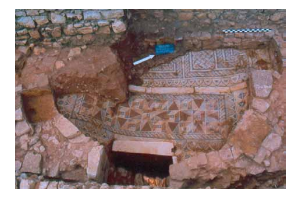
Figure 5 Mosaic of the apse of the long corridor.

To separate the apse area from the remaining corridor area, lying on the floor an alignment limestone slabs. It follows to the west a line of oblong scales and meander swastikas formed from braiding two strands, whose intervals are filled by plaited (Figs. 2, 3, 5). Midway through the corridor the pattern of the pavement