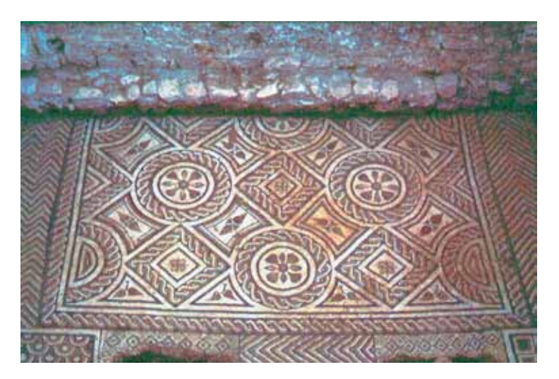
Figure 11 Mosaic of a cubiculum.

In the southwest and southeast corners of the compartment are two carpets. The first larger, whose field comes decorated with scales. In the other, the field is decorated by an orthogonal composition of squares and concentric rectangles. They are still visible bands of the east side and the west side of mosaic. Both with a composition of rainbow in broken lines.