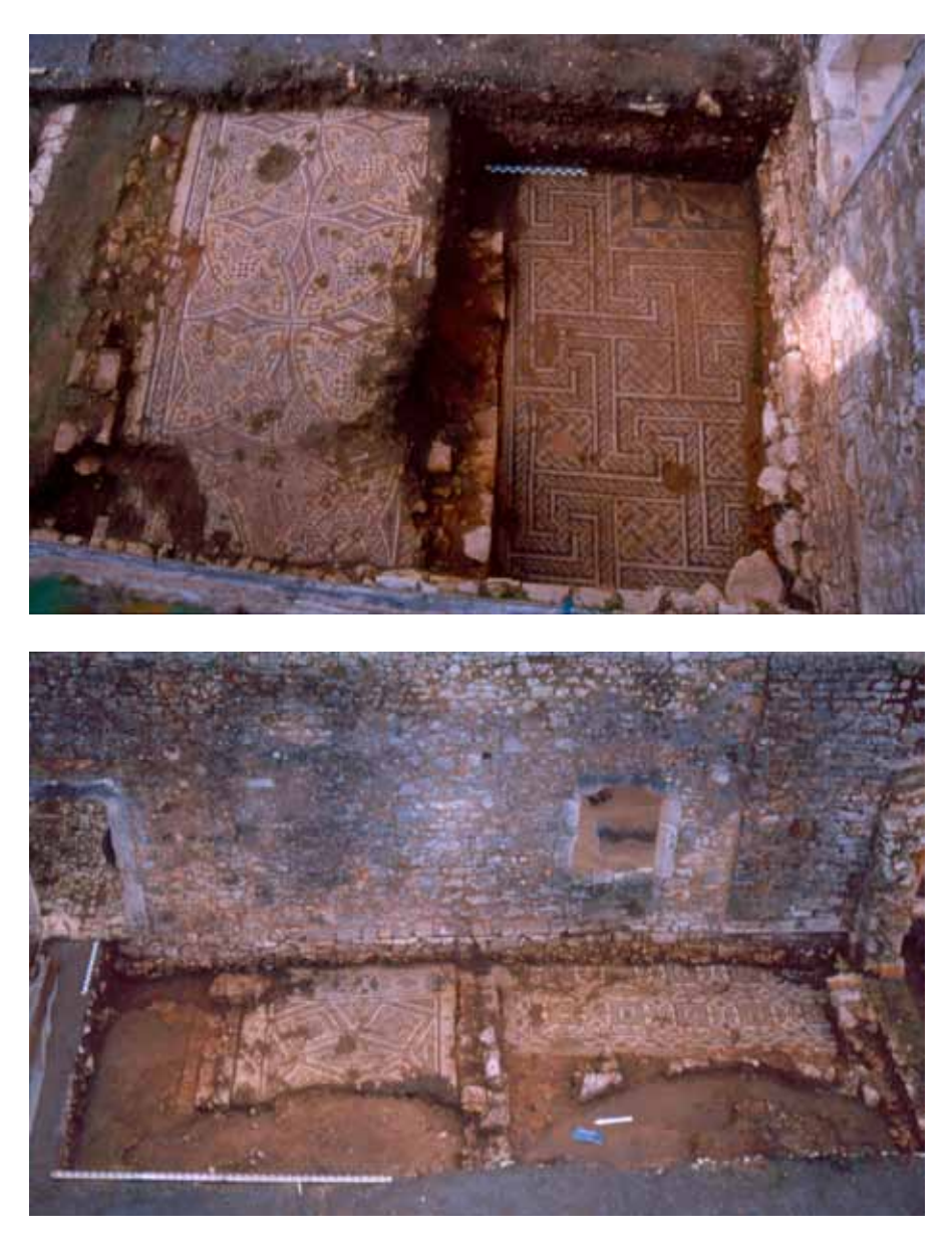
Figure 2 Mosaic of the north portico of the peristyle (at left); Mosaic of the long corridor (at right).