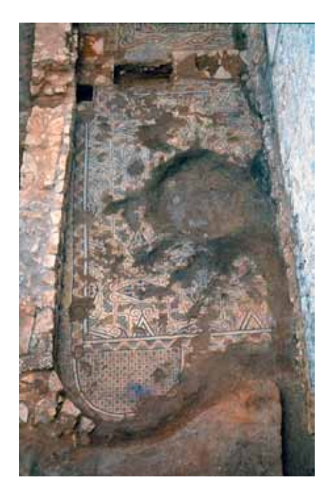
Figure 13 Mosaic of the south area of the space that should have had a social function, as reception room of the Roman building.