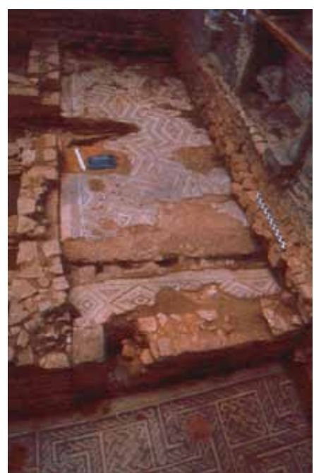
Figure 3 Mosaic of the east portico of the peristyle.

Figure 2 Mosaic of the north portico of the peristyle (at left); Mosaic of the long corridor (at right).