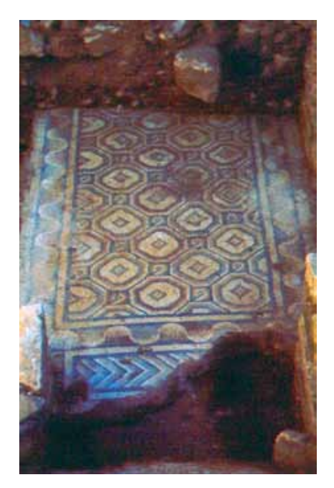
Figure 9 Mosaic of the small corridor.

Figure 10 Mosaic of the apse of the support room to triclinium.