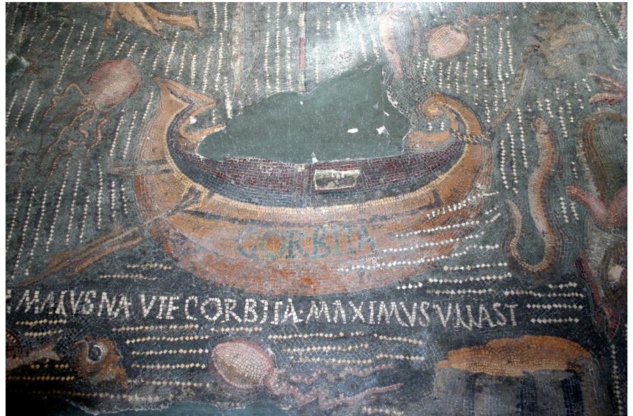
Figure 2 Ship ' Corbita ' from the mosaic in Althiburus (Grossmann 2011: 40 fig. 67).

the ships' names and uses, is an example of it. Fig. 2 is a picture of the diagram shown in Fig. 1 (top row on the left) of the vessel Corbita . Another example of the various types of the display is the great number of ships depicted on the 2 nd century floor of Foro delle Corporazioni, Ostia (Italy), and the Nile mosaic at Palestrina (Italy) from the 1 st century BC (Meyboom 1995: fig. 6).