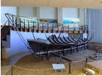
Figure 6 The Ma'agan Michael ship, as salvaged from the sea. Today in the Hecht Museum, Haifa (Linder - Kahanov 2003).

Homer describing how Odysseus built himself a boat when he left the island of Calypso (Hom.Od. XII, 432), or Vitruvius (Vitr. 2. 9) describing the wood used for boat building.