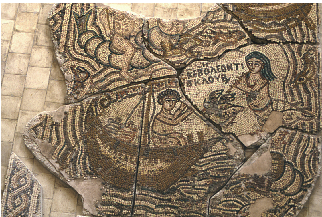
Figure 12 Boat from the Nilotic scene, Beth Shean, Israel. 5 th century AD (Grossmann 2011: 33 fig. 56).