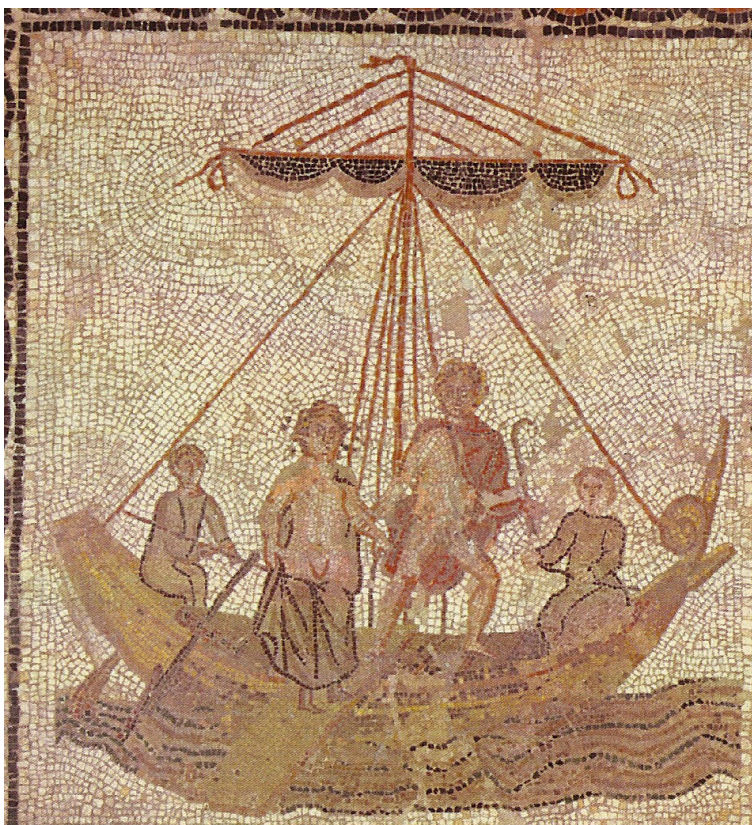
Figure 9 Theseus and Ariadne (Daszewski 1977: pl. 30).