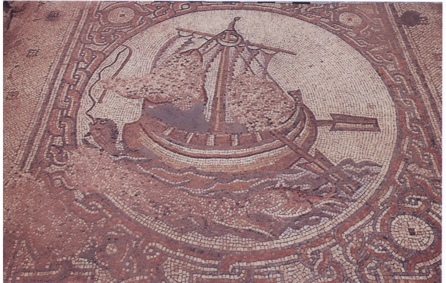
Figure 13 Ship from the Church of Beith Loya, Israel, 500 AD (Grossmann 2011: 39 fig. 66).

At Beth Loya (Israel) (Fig. 13), situated halfway between Hebron and Ashkelon, the region of the ancient Roman town Eleutheropolis (Patrich - Tsafirir: 1993a; 1993b), a church complex paved with mosaic carpets was excavated. In one of the aisles a medallion of 1.47 m diameter showing a fishing boat can be found. Here too the brails are emphasized, but most important is the massive ring, connecting the yard with the sail to the mast, making it possible to raise and lower the sail, as well as to turn it into the wind. The planking of the hull is represented by different colors. There is a railing on top of the gunwale.