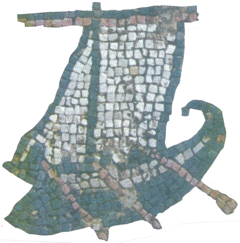
Figure 4 Migdal Nunia, Israel, floor of the 1 st century AD.