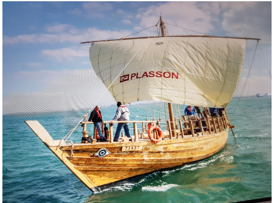
Figure 7 Ma'agan Michael II (Photograph by Ilan Ben Zion - University of Haifa). ( https://www.haifa.ac.il/index.php/en/bogrim-top-white-2/68-english/tehuda-eng/2548-after-2500-years-the-ship-from-ma-agan-michael-goes-back-in-the-water.html )

We will take as an example for the importance of iconography the wreck of the merchant ship found on the Israeli shore at Ma'agan Michael (5 th century BC) (Figs. 6-7). Here too, only part of the 11.25 m long and 4 m wide hull was preserved. It was decided to build a replica, which was finished in 2016. The replica was launched as Ma'agan Michael II and is suitable for seafaring.