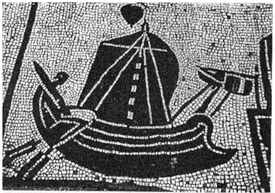
Figure 3 Ship from the mosaic floor of Foro delle Corporazioni, Ostia, Italy, 2 nd century AD (Basch: 1987: 1056 Station 32).

The mosaic floor of Foro delle Corporazioni, Ostia (Italy), is dated to the 2 nd century AD. The image of the ship (Fig. 3), given here as an example, shows a device extending the keel at the bow, possibly signifying that this device could have been either a battering ram or a cutwater. This is also represented in other specimens, such as on the 1 st century floor at Migdal Nunia (Israel) (Fig. 4), the Haditha mosaic (Israel), 6 th century AD (Fig. 5) (Avi-Yonah 1972). Raban (1988: 50-51) explains that the main reason for extending the length of vessels by lengthening the keel at the bow was to improve their hydrodynamics and stability.