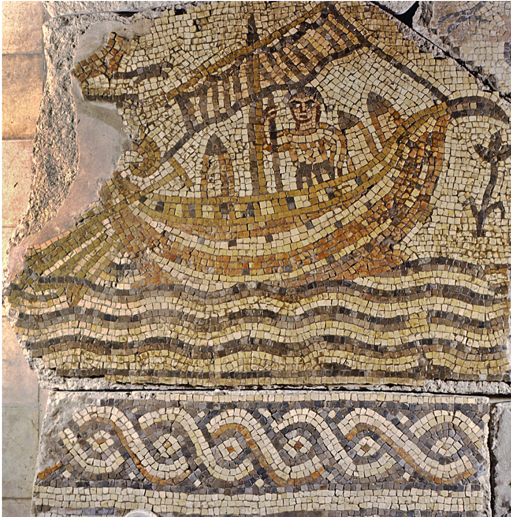
Figure 11 Boat from the Nilotic scene, Beth Shean, Israel. 5 th century AD (Grossmann 2011: 34 fig. 58).