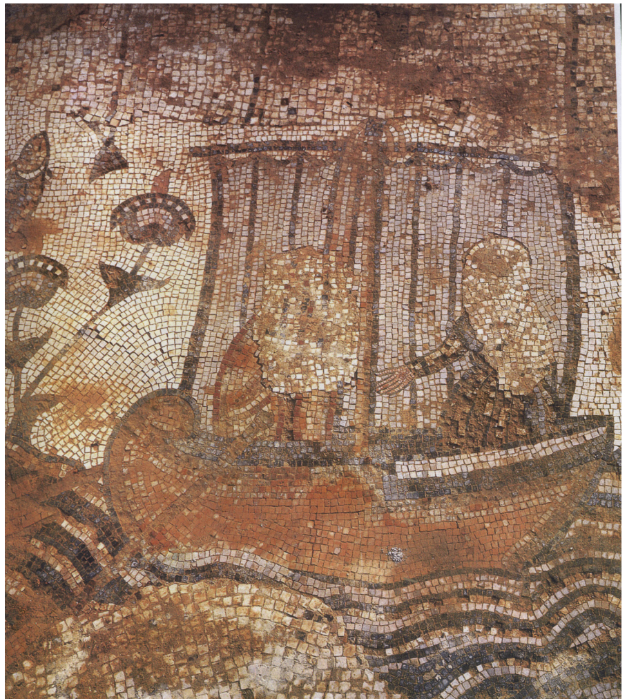
Figure 10 Sailing vessel, Zay al-Gharby, Jordan, 5 th -6 th century AD (Piccirillo 1993: fig. 660).

In a more stylistic illustration of the same period, in the Beth Shean (Israel) 5 th century AD mosaic (Fig. 11), the sail is partly lifted and the brails, here too, are depicted by vertical lines. Examples are abundant.