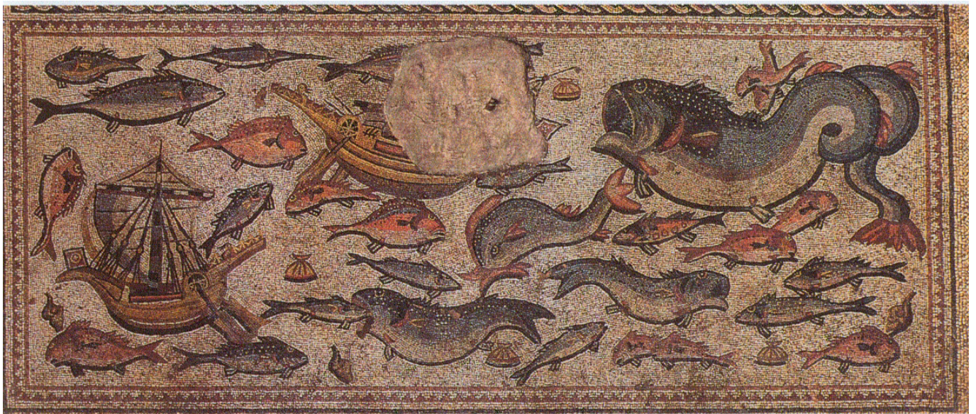
Figure 8 Lod, Israel. Mosaic with two merchant ships. 3 rd to 4 th century AD (Grossmann 2011: 28 fig. 45).

accurately than the other ship, which is shown under sail. The mosaic is executed to such perfection that the wind in the sail can be sensed. The massive, tapered mast stands slightly forward off the middle. The yard holding the sail is about one third of the length of the mast, located close to its top. It was possible to raise or lower the yard, as required by sailing conditions. Above the yard is a small triangular sail. The main square sail when not in use, would have been folded and tied to the yard, similarly to the ship from the mosaic at Salzburg (Austria), depicting Theseus and Ariadne (Fig. 9) (Daszewski 1977: pl. 30). On the bow of the Lod ship is a 'castle', possibly the captain's cabin. At the stern is a projecting beak with railing, decorated for luck by a goose-head. The two Lod ships, as said, show the finest details of the hulls, masts, rigging, sails, decks and