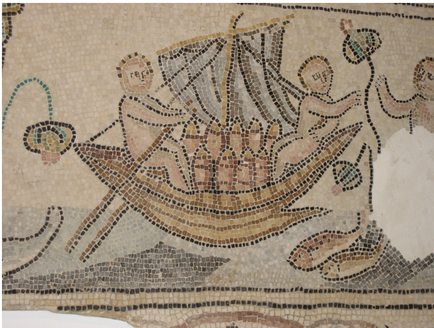
Figure 5 Detail of ship from the Haditha mosaic, Israel, 6 th century AD (Grossmann 2011: 41 fig. 69).

Shipwrecks found on the sea floor, not only in a shallow but also in deep waters, (Stemm - Kingsley 2013: 123-126 fig. 2) are mostly covered by ballast stones and cargo, and only small parts of the hulls remain preserved. The upper parts are mostly missing.