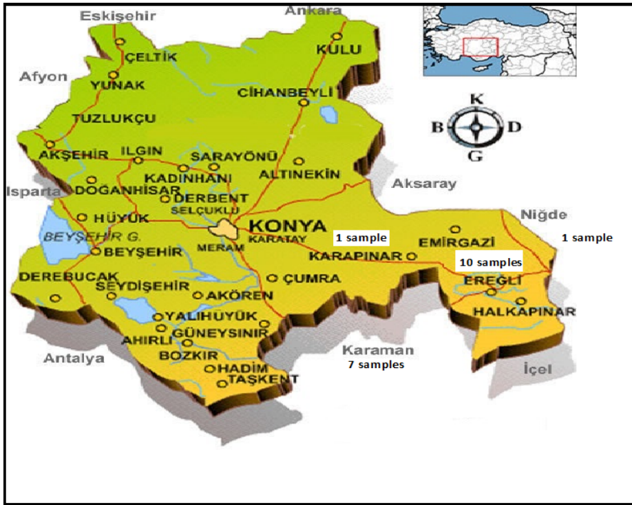
Figure 1. The map is showing the collecting area in examined honey samples

of glycerine was added to the residue in the tube. 0.01 mL of this mixture was taken for preparations. Based on the TPN-10 value, the pollen grains were classified into 5 categories; Category I (< 20,000 pollen grains per 10 g honey), Category II (20,000-100,000 pollen grains per 10 g honey), Category III (100,000 – 500,000 pollen grains per 10 g honey), Category IV (500,000 – 1,000,000 pollen grains per 10 g honey), and Category V (>1 000 000 pollen grains per 10 g honey) (Jose et al. 1989).