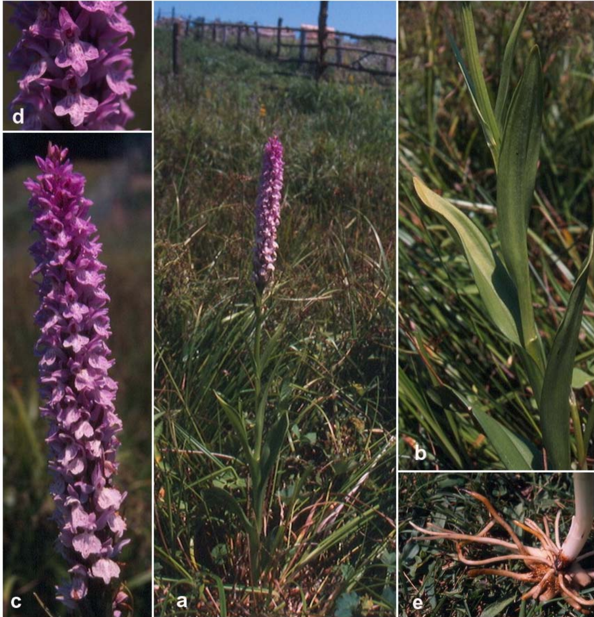
Figure 1. Dactylorhiza maculata subsp. maculata in the wild.

Distribution, Ecology and Habitat: D. maculata subsp. maculata known only from Uludağ Mountain in Turkey (Figure 2). It grows together with Rumex conglomeratus Murray, Epilobium roseum Schreber subsp. subsessile (Boiss.) P.H. Raven, Digitalis ferruginea L. subsp. ferruginea , Scrophularia umbrosa Dum., Euphrasia pectinata Ten., Lysimachia verticillaris Sprengel on grassland, wet and marshy grounds at 1000-1100 m altitude.