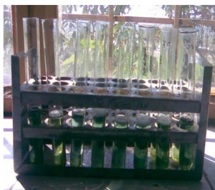
Figure 2: Various Phytocontent Test for Mucuna Seeds