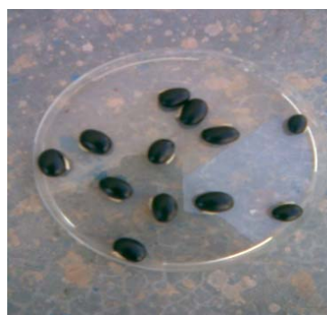
Figure 1 b: Seeds of Mucuna pruriens