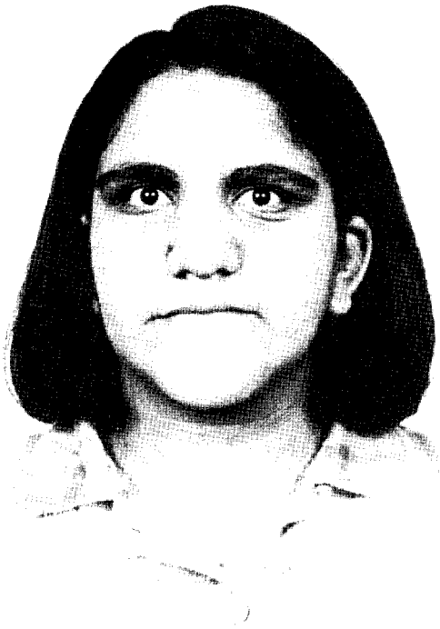
Fig. 1. Characteristic facial appearance of our patient with hyperimmunoglobulin E syndrome.