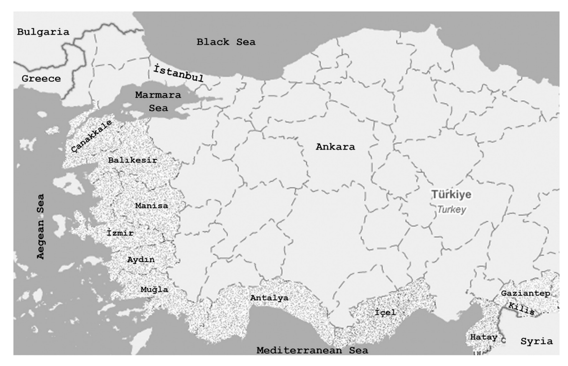
Figure 1 – Map of Turkey showing the provinces where leaf samples were collected. Çanakkale and Balıkesir are in the Southwestern Marmara Region, Aydın, İzmir, Manisa and Muğla are in the Aegean Region, Antalya is in the Western Mediterranean Region, İçel and Hatay are in the Eastern Mediterranean Region, and Gaziantep and Kilis are in the Southeastern Anatolia Region. The part of Turkey shown on the map is located between 36°00' and 42°00' N, and between 26°00' and 38°00' E.