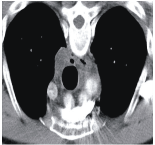
Figure 2. Thoracic CT scan demonstrating mediastinal collection of fluid and air (case 8).

There was a broad age range (16–72 years) among our patients, the male sex was more common, and infections of oropharyngeal origin were the leading cause. The second most common cause was esophageal perforation. Nine of the patients (69%) were admitted to the emergency clinic. Surgical interventions varied, depending on the presentation of DNM (Table). Intravenous broad-spectrum, effective antibiotic therapy was administered to all patients. Antibiotherapy should be effective to gram-positive, gram-negative, aerobic, and anaerobic agents.