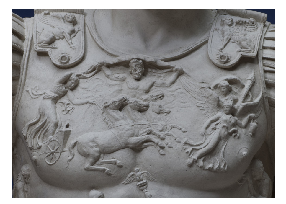
Figure 10 Detail of Caelum on the cuirass of Augustus Prima Porta, Museum für Abgüsse Klassischer Bildwerke München, Inv. 274. © Museum für Abgüsse Klassischer Bildwerke München, Abguss Inv. 274. Photo: Roy Hessing (Detail).

The depiction of Caelum on the cosmological mosaic differs fundamentally from his usual way of representation. The figures are of a different age (beardless/full beard), posture and motive differ distinctly (leaned back and enthroned, hand loosely put on Saeculum/holding his cloak over his head with raised arms) and the particularising attribute was substituted with an unspecific wreath. Due to the generalisation of the iconography of Caelum, he can no longer be identified by means of his form of representation alone. On the basis of his youthful appearance and his relaxed posture while sitting enthroned, Caelum could have instead been connected to other mythological figures, like for example Dionysos<sup>26</sup>.