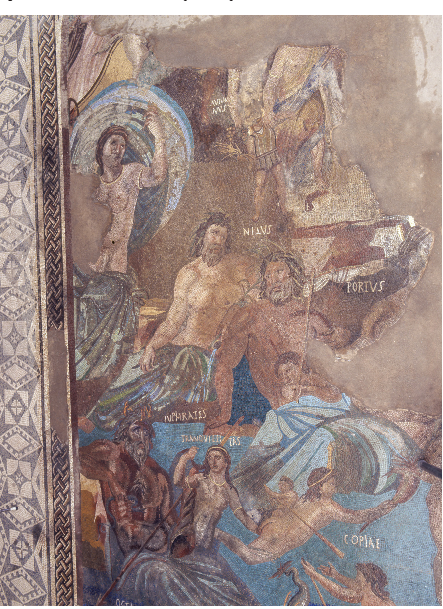
Figure 3 Terrestrial level of the cosmological mosaic.

In the middle, terrestrial level (Fig. 3) sits Natura, whose velum flutters up behind her. Beside her are the lying river deities Euphrates and Nilus, both wearing wreaths of reed on their heads. Euphrates holds a jug from which water is flowing out and a boy with a sailing mast in his hand sits on Nilus' lap. The figure Portus is hardly preserved; all that is left is a part of the head with a mural crown and parts of the upper body. Beside Natura's velum are the seasons Autumnus and Aestas carrying their usual attributes; they are about to walk through the zodiac ring, which is not preserved (Alföldi 1979: 6-8)8. The latter is held by Aeternitas, who inhabits the central position on the mosaic. Only the naked muscular upper body and the head with a head wing is preserved from the personification of eternity<sup>9</sup>. The large defect around Aeternitas continues all the way to the bearded Mons, who is depicted at the outer edge of the decorative field. The sleeping figure Nix – snow – lies on the lap of the personification of the mountains.