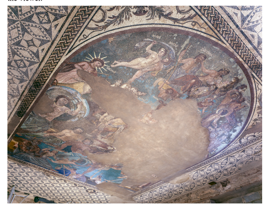
Figure 1 Cosmological mosaic in Mérida.

The cosmological mosaic from the Casa del Mitreo in Mérida (Fig. 1) is one of the most famous Roman mosaics in the western Mediterranean. The mosaic is dated to the late 2<sup>nd</sup> / early 3<sup>rd</sup> century AD. It features a multi-figured decorative panel in which unique references are formed by the combination of the depicted personifications (Quet 1981: 22-23; Gómez Pallarès 2011: 268). However, it is not only the cosmological motive which makes this mosaic an exceptional pictorial work but also the way how it was imparted to the viewer. The complex way in which the factors iconography and inscriptions of some figures have been put in relation has attracted attention. Thereby, different modes of combining iconography and writing can be observed. In some places, iconographic elements have been assigned supposedly unsuitable inscriptions; therefore, image and text are not always as congruous as they usually are<sup>1</sup>. As a result, tension for the viewer is created. However, exactly from this tension the actual intended statement can be extrapolated through a thorough observation and reflection by the viewer.