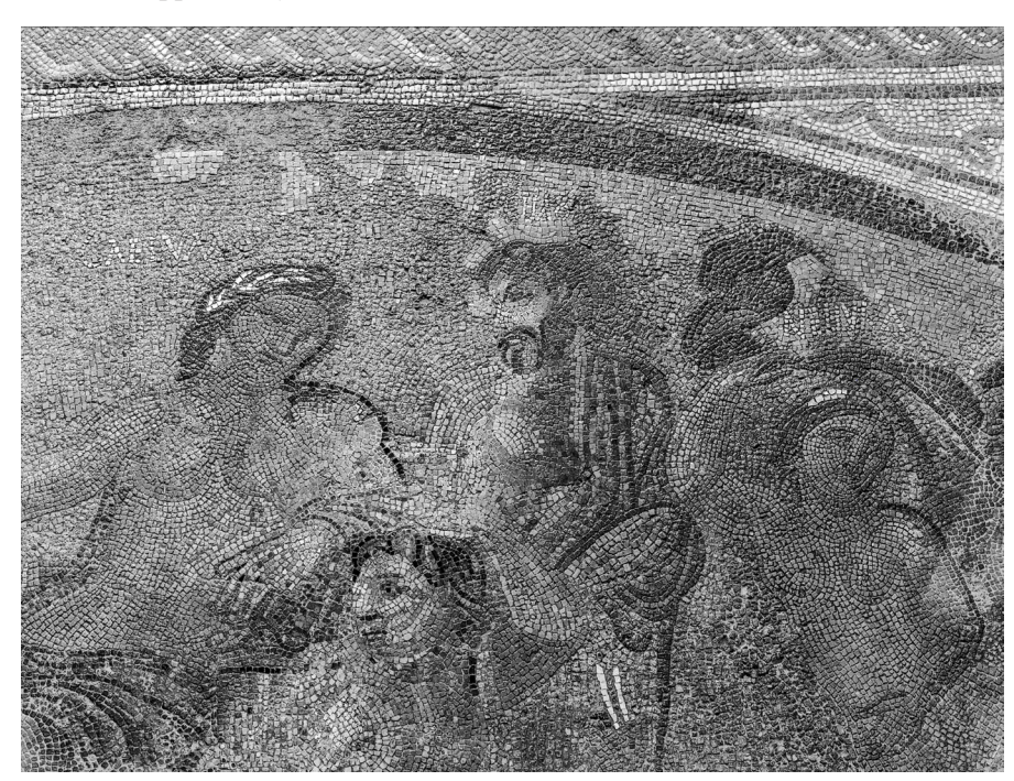
Figure 9 Detail of the personifications Caelum and Chaos on the cosmological mosaic.

Iconographic parallels for the sky god can be found on different media. There, he is depicted with a cloak which billows out over his head and is probably meant to indicate the vault of the sky (Tam Tinh 1994: 135). Usually, he is featured from the upper body up, undressed and bearded (Fig. 10)<sup>24</sup>. There are also parallels on Roman sarcophagi where he appears with the characteristic cloak, albeit younger, that is, beardless. However, such depictions are far less common<sup>25</sup>. As can be seen, Caelum possesses a determined iconographic convention including a particularising attribute without which he never appears. The Greek pendant of Caelum, Ouranos, also conforms to this convention (Tam Tinh 1994: 133).