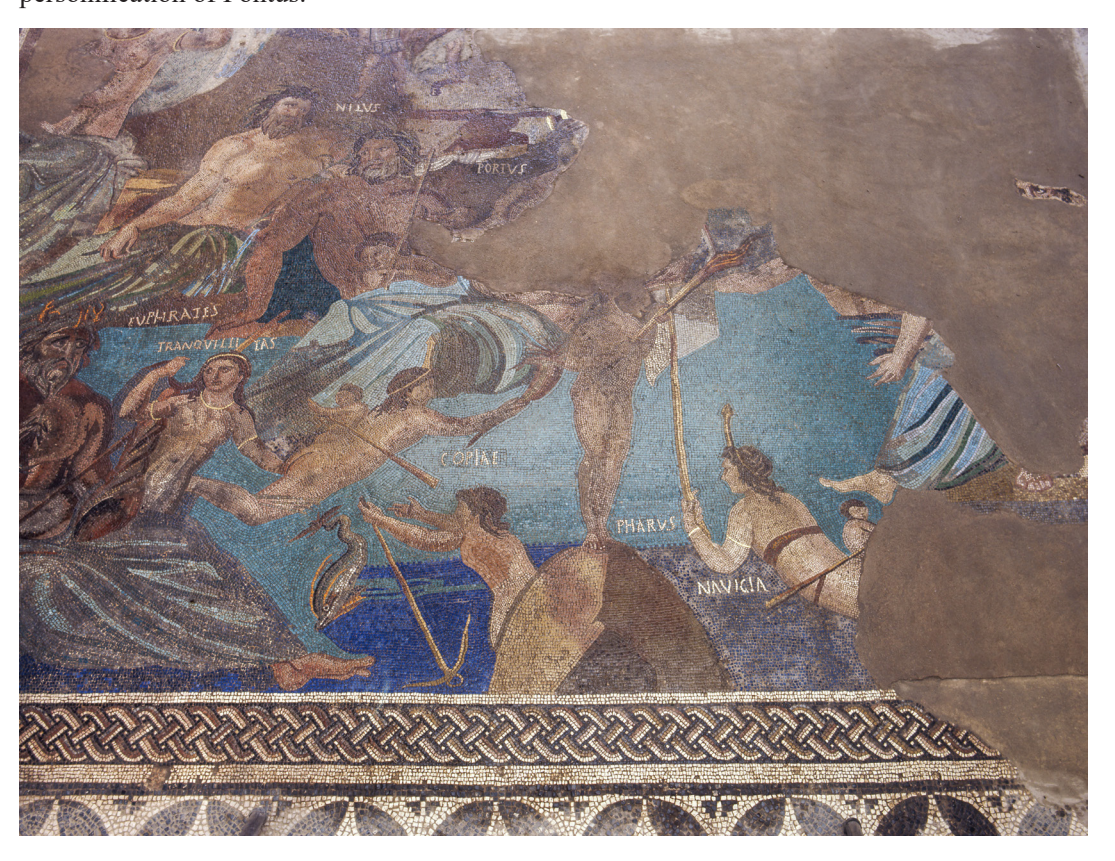
Figure 2 Maritime level of the cosmological mosaic.