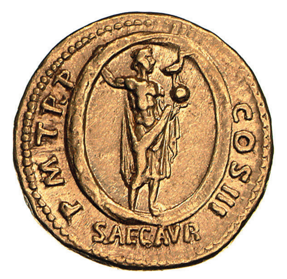
Figure 8 Saeculum Aureum with Zodiakos, globe and phoenix, Münzkabinett der Staatlichen Museen zu Berlin. © Münzkabinett der Staatlichen Museen zu Berlin, 18204693. Photo: D. Sonnenwald.

This now raises the question which specific manifestation of Saeculum is meant on the cosmological mosaic. The personification Saeculum, who we otherwise only know in combination with an epithet, embodies two different meanings and possesses three different determined pictorial schemes. The figure of Saeculum on the cosmological mosaic mostly corresponds to the iconography of the enthroned Saeculum Frugiferum/Ba'al Hammon<sup>21</sup>. Nevertheless, the personification on the mosaic appears without the particularising attributes modius, sphinges and ears of grain, which have been substituted by the nonspecific attributes diadem and sceptre. Thereby, this generic manner of representation only reminds of very common father gods which the antique viewer could connect to several different deities, like for example Zeus, Poseidon or Asklepios<sup>22</sup>. The 'sitting enthroned' and the attributes diadem and sceptre are also quite unspecific, since they can appear in a number of (father) gods.