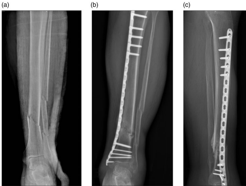
Figure 2. Representative X-rays of a patient in the distal 1/3 tibial shaft fracture group. (a) Pre-operative anteroposterior (b) Final follow-up anteroposterior, (c) Final follow-up lateral.

and the size of the fracture gap play a critical role in the time to fracture healing. 3,16 Horn et al. reported on the role of the lag screw on fracture healing in 41 patients, including 27 patients who underwent MIPO technique compared with 14 patients treated with conventional open reduction and internal fixation, and reported faster fracture healing with lag screw application. 17 None of our patients had nonunion with the MIPO technique, and we think that nonunion is the most devastating complication after tibial shaft fractures. The fracture healing time in our study was similar to previous reports.