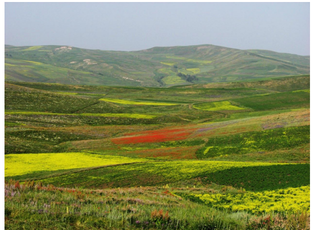
Figure 1: Uzgen district, the flowering plants in June

produce, as several powerful melliferous plants bloom simultaneously during the beekeeping season. Therefore, the name of Kyrgyz honey is usually indicated by the collection area and not by its botanical source. The most popular and famous kinds of honey in Kyrgyzstan are collected from mountainous regions such as Toktogul, Sary-Chelek, Kara-Shoro, and At-Bashy (Kadyrova and Smanalieva 2017). According to a palynological investigation, Toktogul honey has pollen of such herbs as blueweed ( Echium vulgare ), sainfoin ( Onobrychis sp.) chervil ( Anthriscus sylvestris ), family Brassicaceae , mint ( Mentha sp.), oregano ( Origanum sp.), St. John's wort ( Hypericum sp.), thyme ( Thymus ), sweet clover ( Melilotus officinalis ), dandelion ( Taraxacum ) and many other mountain plants (Smanalieva 2008).