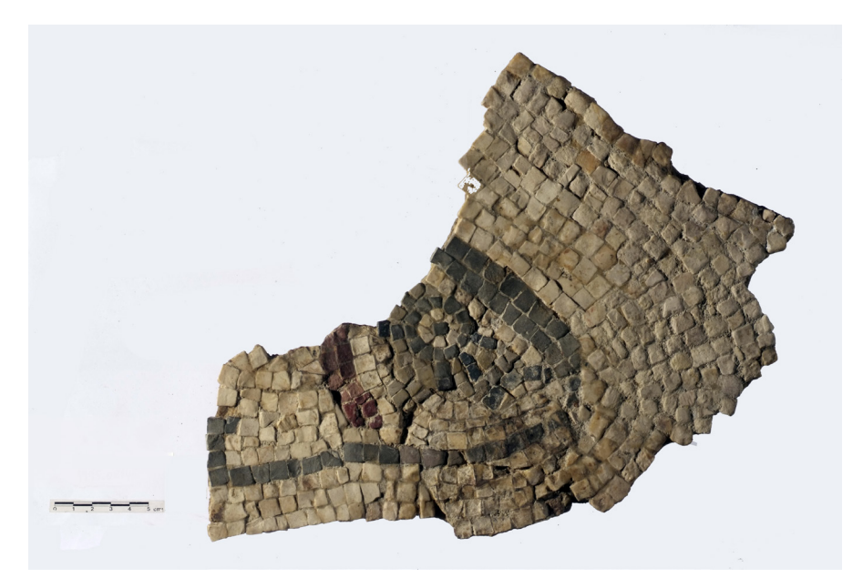
Figure 8 Mosaic fragment of Cardoso da Saudade, Braga, with a fish head (CMRCB, Mosaic 13, fig.34); ©AFMDDS.

If there are strong similarities regarding the geometric and geometric-vegetal themes between the mosaics from Conuentus Bracaraugustanus and those from the Hispanic NW, the similarities seem evident in the so-called "maritime" themes and representation of aquatic environments. Some fish species, moray eels, bivalves, and urchins are common to the mosaics from Braga, Fonte do Milho, Parada de Outeiro, and Panxón. They are also observed in mosaics from the Portuguese territory part of the Conuentus Pacensis, as in Milreu, Faro, and Villa de Pisões, Beja, in a small tank in one of the rooms open to the tetrastyle atrium. At the bottom of this tank, fish and a moray eel are depicted, with lines suggesting the aquatic environment, some with poised tesserae.