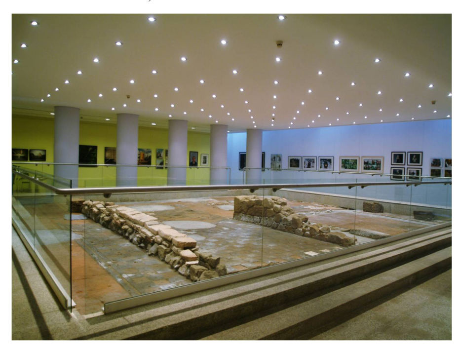
Figure 9 Mosaic of the crypt of D. Diogo de Sousa Museum (CMRCB, Mosaic 1); ©AFMDDS.

this decoration on a mosaic pavement from the northeast cubiculum , dated from the 3<sup>rd</sup> quarter of the 2<sup>nd</sup> century and the 1<sup>st</sup> quarter of the 3<sup>rd</sup> century. In the Sociedade Martins Sarmento Museum collection in Guimarães, there is a mosaic fragment with a chessboard pattern in color opposition from Braga (CMRCB, Mosaic 51), with no dating. It also appears in Rio Maior in panel D of mosaic no. 3, dated to the second half of the 4<sup>th</sup> century. It is also observed in Torre de Palma in the doorsill of room SE10, in polychrome chess, dated to the end of the 3<sup>rd</sup> century, beginning of the 4<sup>th</sup> century (Corpus Portugal II: 246-247 Pl. LXXXVII and Pl. XCIX).