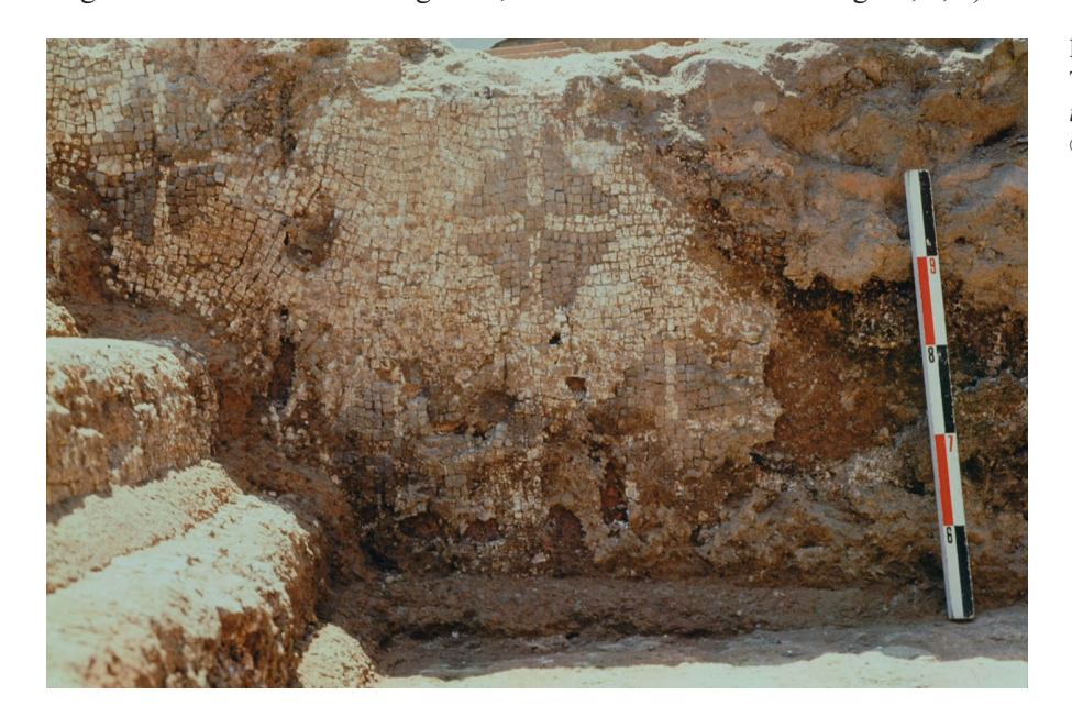
Figure 6 Tank/pool with mosaic decorated with black tesserae florets (CMRCB, Mosaic 11, fig.29); ©AFMDDS.

4. Examples of parallels between structures and mosaic decoration are found in the tanks/pools, with or without steps, with bottom and/or walls covered in white mosaic with black tesserae florets, from Braga, Largo Cardoso da Saudade (CMRCB, Mosaic 11), and the Villa of Requejo, Zamora. (Fig. 6). The same decoration was executed on the small tank from the caldarium of the Villa Cuevas de Soria; the contraposed apses pool in the Place of Sta Maria de Lugo, with half- florets, and the small tank with steps in Milreu, Faro (Abraços 2015; Regueras Grande 2015: 299 fig. 19 a; Torres Carro 2019: 38-41 figs. 1, 2, 3).