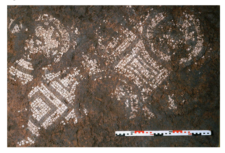
Figure 2 Detail of the mosaic from the domus of the «Escola Velha da Sé», Braga; (CMRCB, Mosaic 15, fig. 39).

1. We begin by mentioning the 3<sup>rd</sup>/4<sup>th</sup>-century mosaic of a Domus in Rua D. Afonso Henriques, nº1 Edifício da Escola Velha da Sé (CMRCB, Mosaic 15-16)<sup>4</sup> (Fig. 2). The compositional scheme of tangent outlined circles and poised squares, forming bobbins, which expanded during the 2<sup>nd</sup> century to the western part of the Empire, is an almost identical parallel to one of the mosaics from the Quinta da Ribeira, Tralhariz, (Carrazeda de Ansiães), with a scheme applied in a strip, possibly connecting to the wall. This fact leads to the assumption that the artisans who made it applied the same model at a slightly later date (CMRCB, Mosaic 93) (Figs. 3-3a). In other mosaics from the Portuguese territory, the same compositional scheme is observed at the Villa of Coriscada, Meda (3<sup>rd</sup>/4<sup>th</sup> century), south of Tralhariz, and, with a more exuberant decoration in the simple guilloche involving the circles and squares, in the Villa of Santiago da Guarda, Leiria (Conuentus Scallabitanus), whose mosaics have been dated in genere to the 4th/5th century; in the "Casa da Medusa," Alter do Chão, Portalegre (Conuentus Emeritensis), in two lateral panels of the triclinium's figurative mosaic, dating from the 3<sup>rd</sup>/4<sup>th</sup> century; and in a mosaic from Boca do Rio, Vila do Bispo (Conuentus Pacensis), a mosaic kept in the Santos Rocha Museum in Figueira da Foz.