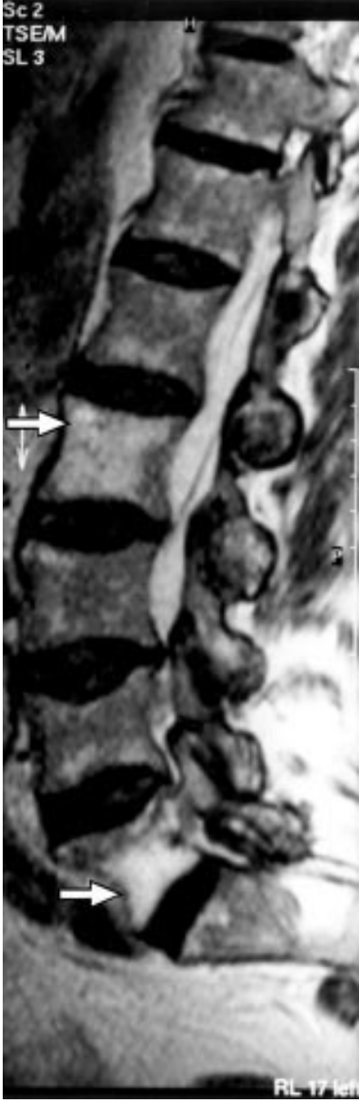
Figure 1 Sagittal MR scan of the spine showing vertebral infiltration, being most intense in L2 and L5, which is biconcave (arrows).

He had a past history of epilepsy, which was controlled by phenytoin and phenobarbitone. In 1993 he was admitted with abdominal pain, splenomegaly, and pancytopenia; this was diagnosed as low grade B cell lymphoma and hypersplenism. Splenectomy was performed in 1994, his blood count returned to normal, and repeated full blood counts were