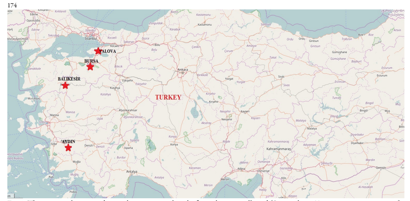
Fig. 1. The signs on the map indicates the provinces where leaf samples were collected